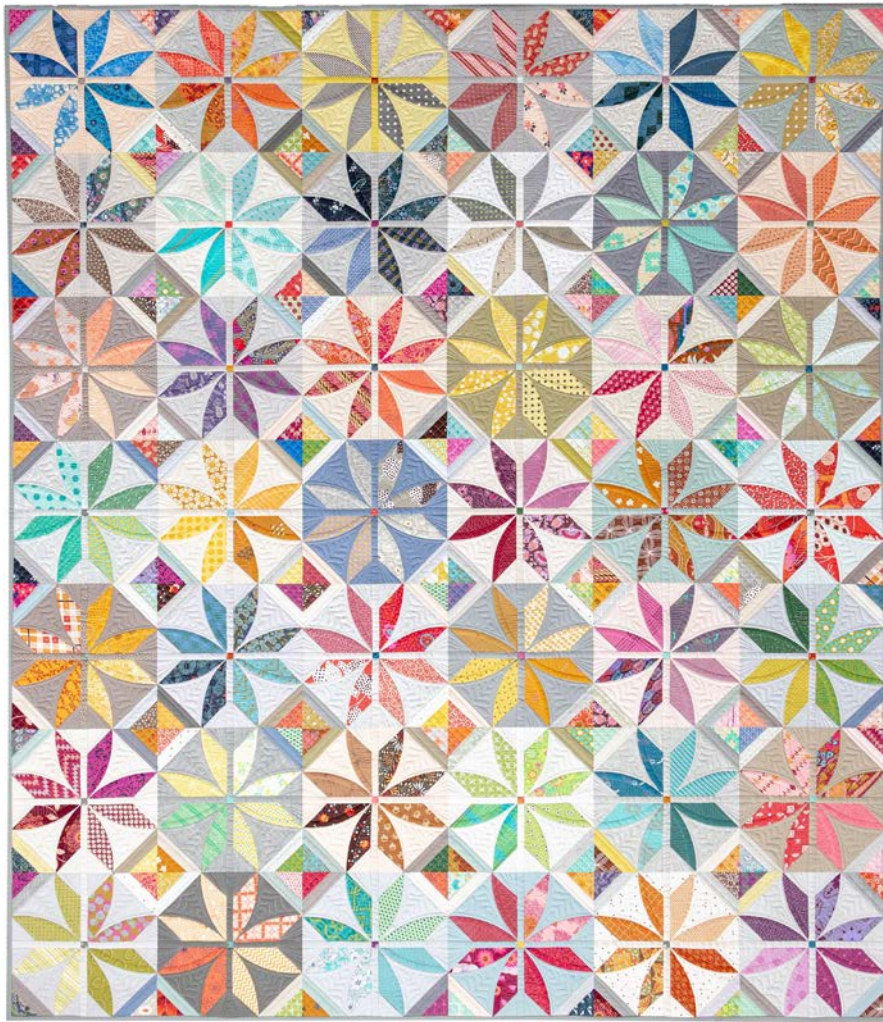
Posh Penelope 69 x 80

Posh Penelope is a fun scrappy quilt that combines our love for curves with petite sashing and cornerstones! The perfect mix of modern and traditional elements that create a quilt that is timeless. Posh Penelope uses the Quick Curver Ruler and the Sew Square 6 to make cutting curves quick and easy, and squaring up the blocks a snap! Easy curved sewing technique is taught - no pinning, no finding center. Just cut, sew, and square-up.